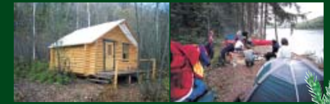
Halte des Draveurs

Reservations: 1-800-665-6527 (toll free) or (418) 890-6527 (Québec City area)