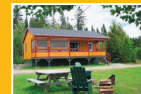
Big Lac-Kedgwick #3 cabin