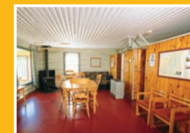
Inside Lac-Rimouski cabin