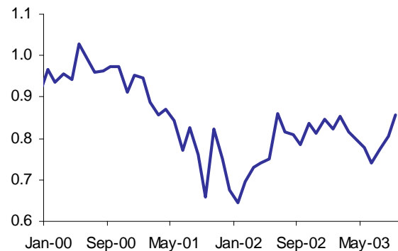
Overseas Exports ($billion, sa)

• Shipments of goods manufactured in the province increased for the third consecutive month in September (+2.5%, seasonally adjusted) as the manufacturing industry began to pick up speed after stalling at the beginning of the year. The improvement was largely driven by a turnaround in the wood products industry, where shipments have been climbing since June.