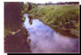
SITE 1A, STILLWATER CREEK MAIN CHANNEL