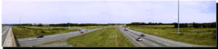
'A' - VIEW FROM MOODIE EASTERLY