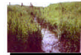
SITE 1B, STILLWATER CREEK UPSTREAM OF THE QUEENSWAY