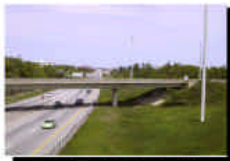
'B' - AVIATION PARKWAY EAST TO 174