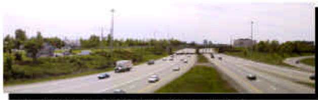
'A' - AVIATION PARKWAY LOOKING WEST