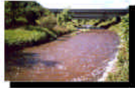
SITE 6, GREEN'S CREEK AS IT FLOWS BENEATH THE QUEENSWAY