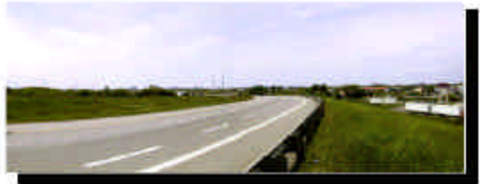
'A' - RAILWAY OVERPASS LOOKING WEST