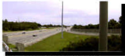
VIEW B - EASTERLY FROM RICHMOND ROAD OVERPASS