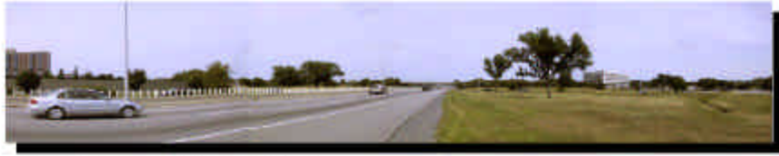
VIEW 'A' - EASTERLY FROM GREEN BANK ROAD