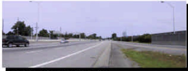
VIEW 'A' - EASTERLY FROM WOODROFFE AVENUE