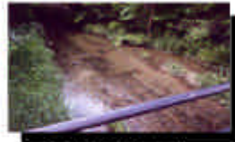
SITE 3, PINECREST CREEK DOWNSTREAM OF THE QUEENSWAY