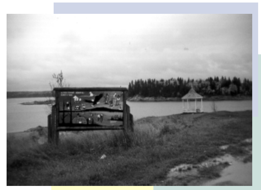
Sandy Bay, Saskatchewan -- October 2001.

We all take seriously our obligations to the province of Saskatchewan and were concerned that we might not be reaching out to our entire constituency. Rather than speculating, we decided to talk to residents in the north. We wanted to hear their concerns about rights, fairness, equality and equity and to learn how each of our offices might provide more effective and more valuable services.