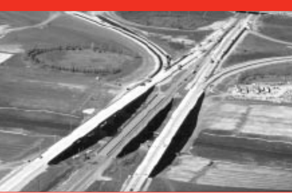
The Trans-Canada Highway #1 east bridge was opened to traffic in the fall of 2006.

In the spring of 2007, two consultant firms received awards from the Consulting Engineers of Manitoba for their significant contributions to the floodway expansion project. ND LEA Inc. won the Award of Excellence in Infrastructure for temporary railway detours on the project. As the new railway bridge is completed, the detour bridge is dismantled and then the piers and steel decks are moved downstream and re-erected at a new bridge replacement project. This design has significantly reduced costs and the environmental impact of construction since piers are reused a number of times, rather than being demolished and reconstructed after every use.