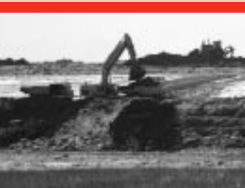
Channel excavation during the winter of 2007.

Replacement and Upgrade of the PTH 59 South Bridge - PCL Constructors Canada Ltd. is replacing the two existing bridges. The bridges will be higher and longer to ensure that they are above the one-in-700 year flood level. In addition, Prairie Grove Road is being relocated higher along