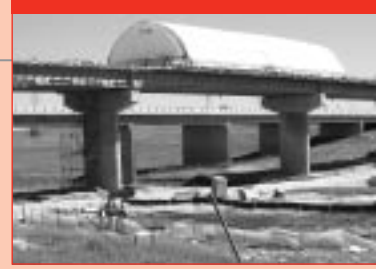
Construction of the PTH 59 south bridge is scheduled to be completed by end of the year.

West Dike - The west dike, located southwest of Winnipeg, is being extended and raised, providing better protection against wind and waves during major floods. The work will include dike construction, ditch grading, culvert installation, traffic control, temporary detours, traffic signs, silt fencing and other temporary erosion control measures, granular road surfacing, rock riprap and revegetation. The first 10 kilometres (six miles) of a section of the west dike has been completed. Work has begun on the remainder of the section from the inlet to PR 330.