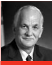
Honourable Ron Lemieux, Minister Manitoba Infrastructure and Transportation and MLA for La Verendrye

E ach and every spring, the waters of the Red River rise, occasionally posing serious challenges to Winnipeg's existing flood protection system. As the 1997 Flood of the Century demonstrated, Winnipeg came within inches of a potential major social, economic and environmental disaster.