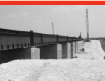
The CN Sprague railway bridge project was completed this spring.