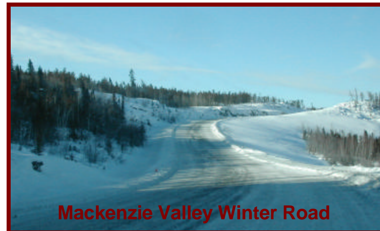
Mackenzie Valley Winter Road