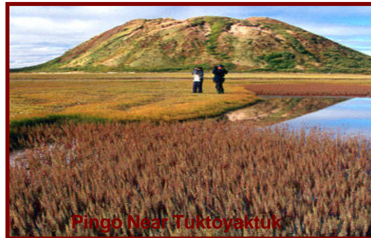
Pingo Near Tuktoyaktuk

In the three northern territories, only one road, the Dempster Highway, crosses the Arctic Circle. This road does not reach the Arctic coast. The Arctic coast perimeter is longer than Canada's other two coasts combined. This vast, remote and largely unpatrolled coastline poses an increasing threat in terms of national security.