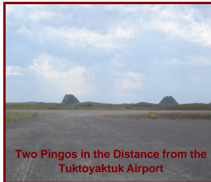
Two Pingos in the Distance from the Tuktoyaktuk Airport

Without an all-weather connection some communities' and residents' access to resource development opportunities will be lost. Also lost, will be an opportunity to move forward on an economic diversification agenda for these communities. The all-weather connection will ensure all communities have access to benefit from resource development and related opportunities.