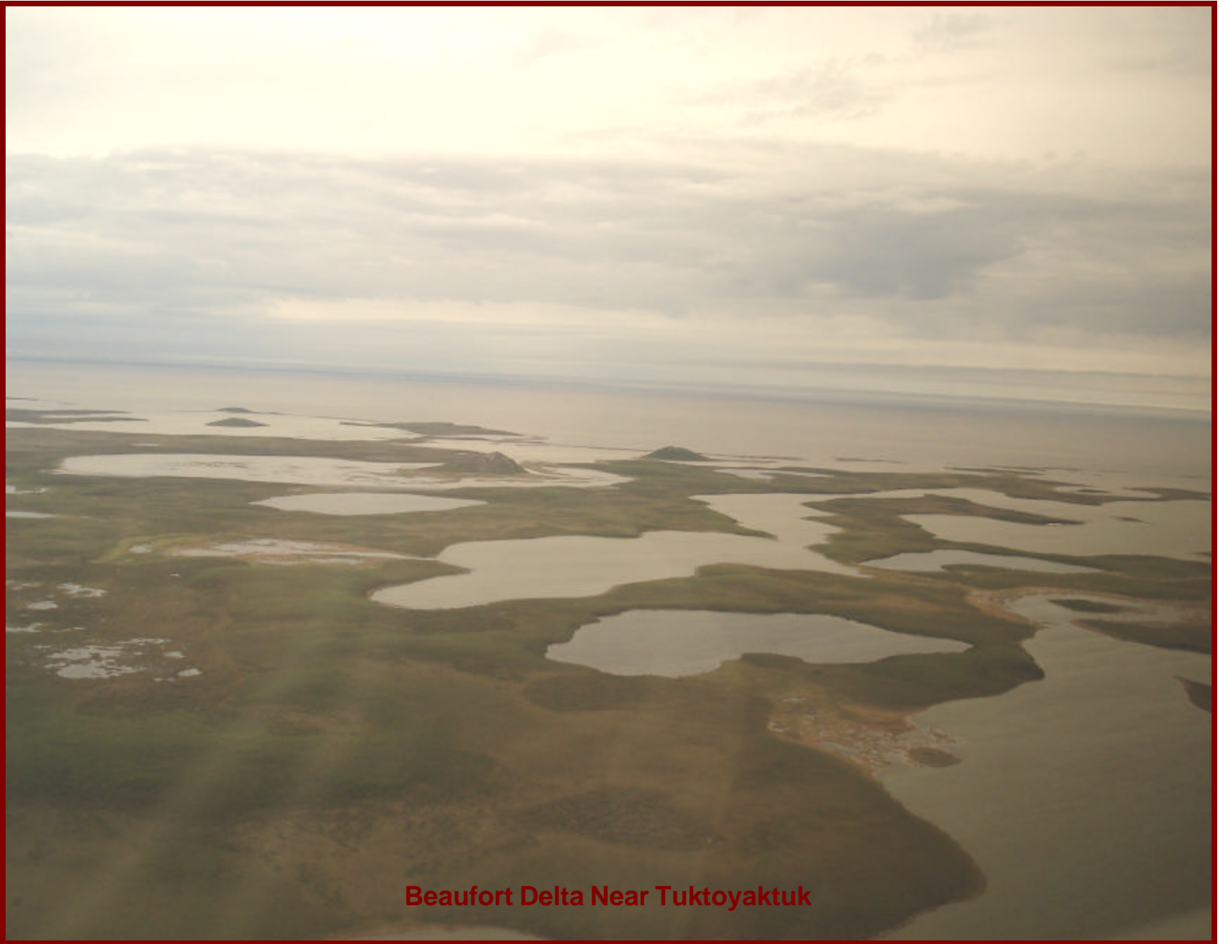
Beaufort Delta Near Tuktoyaktuk