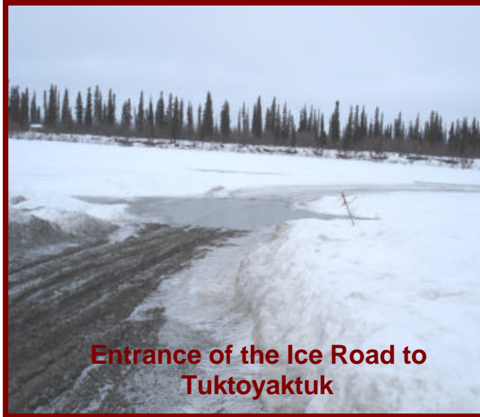
Entrance of the Ice Road to Tuktoyaktuk

In these times of a shifting political landscape, globalization, climate change and energy concerns, the global focus on Canada's North is greater than it ever has been. Correspondingly, asserting Canada's sovereignty has never been so important.