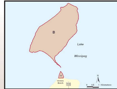
Elk Island Provincial Park