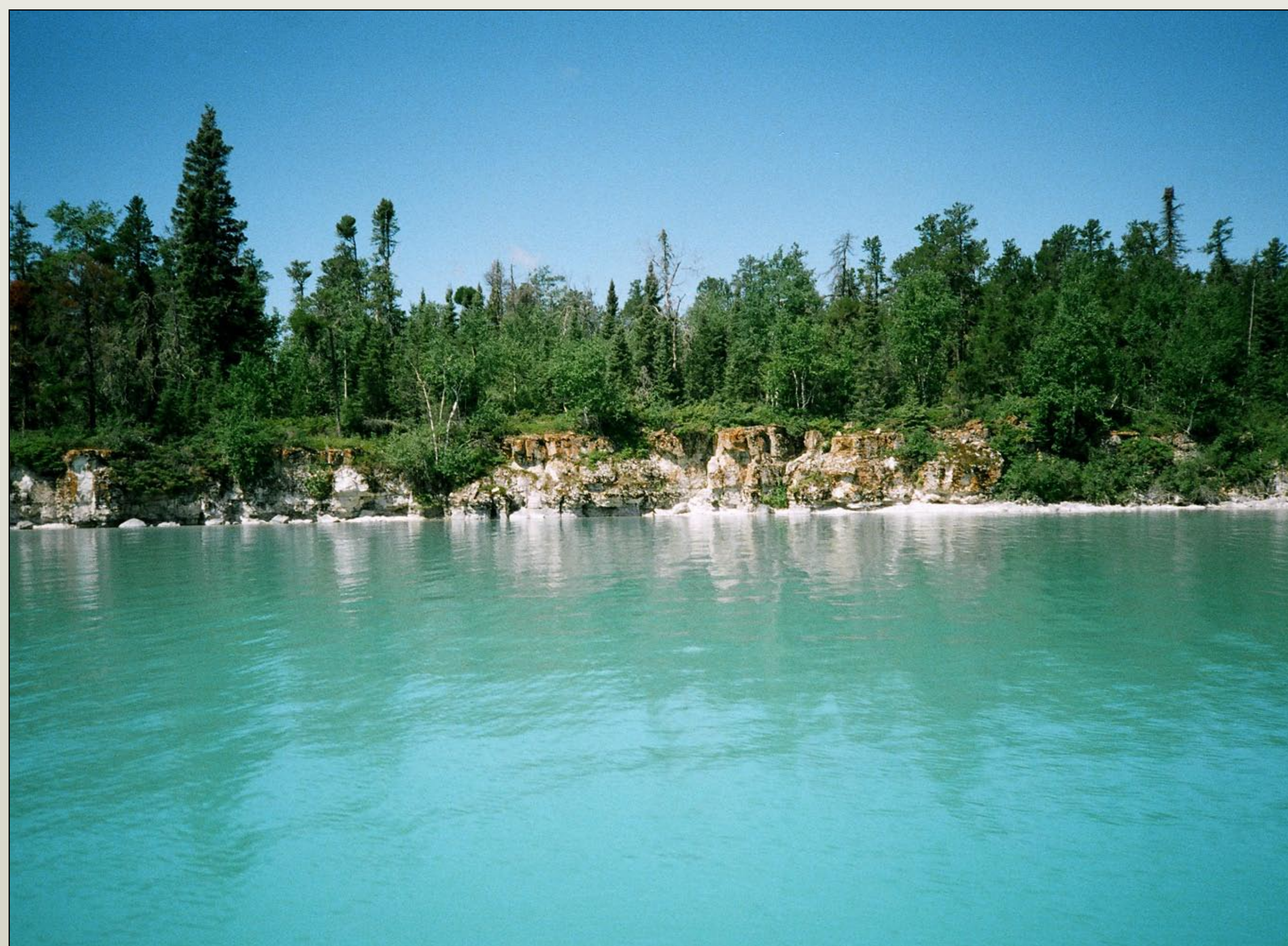
View of the shore on Little Limestone Lake