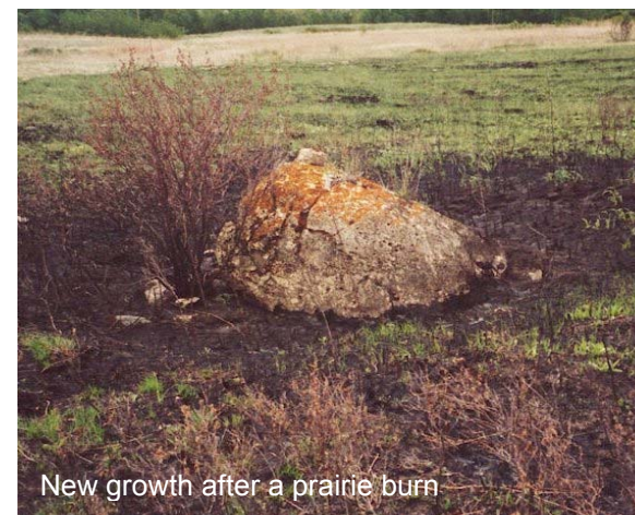
New growth after a prairie burn

The purpose of this public review is to share information and obtain your comments about the proposed change to the boundary of Rivers Provincial Park. Please review the background material supplied and complete and return the enclosed comment form. Help shape the future of Rivers Provincial Park!