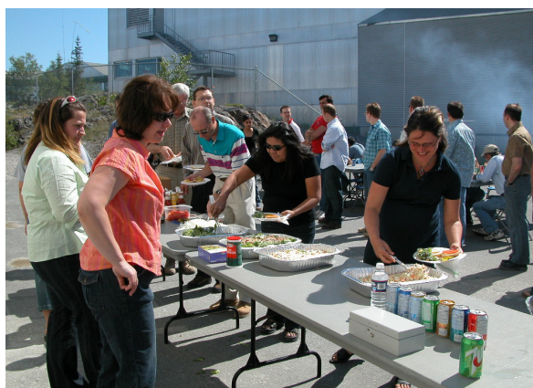
A DOT Barbecue was held for Yellowknife staff in the Lahm Ridge Tower parking lot on June 23.