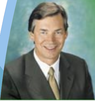
THE PREMIER OF MANITOBA GARY DOER

Manitoba's economy has long been recognized for its steady economic performance. Our $37-billion economy is well diversified, leading to its being one of the most stable in Canada. That's one reason Manitoba has proven to be a great place to live, work and invest.