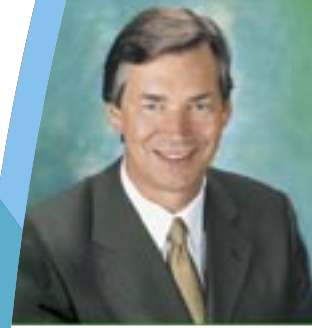
THE PREMIER OF MANITOBA GARY DOER

Virtually all of Manitoba's electrical energy is produced by clean, environmentally-desirable hydro facilities. Manitoba Hydro has 5,000 MW of installed generating capacity, with an additional 5,000 MW of capacity yet to be developed.