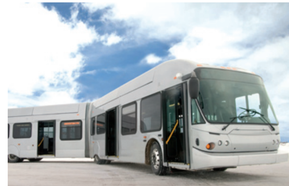
New Flyer Industries: Cleveland BRT pilot bus