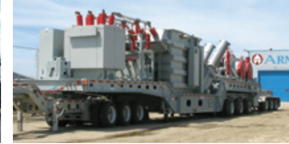
Arne's Welding Ltd: lowbed trailer