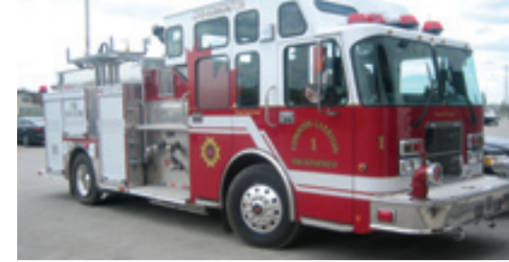
Fort Garry Industries: custom enclosed control MXV