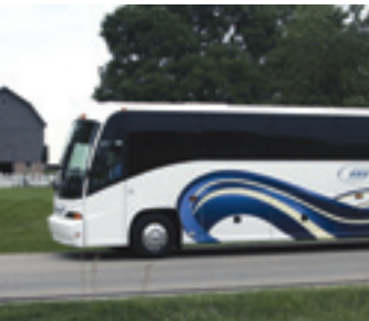
Motor Coach Industries: J4500