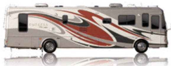
Triple E Canada Ltd: Empress Elite