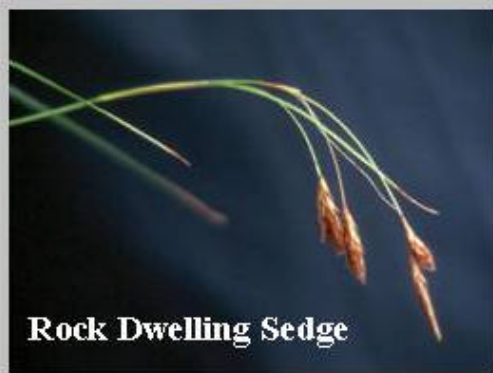
Rock Dwelling Sedge