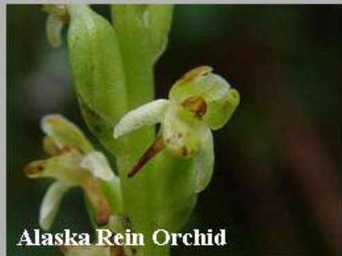
Alaska Rein Orchid