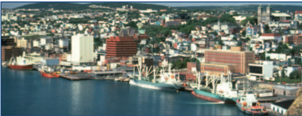
Harbourfront, St. John's