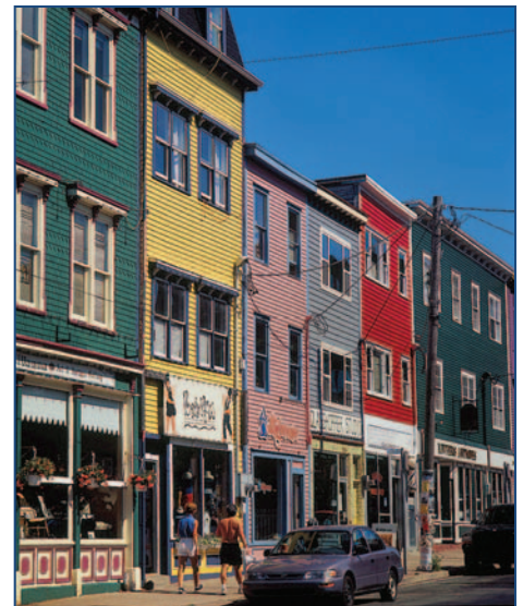
Duckworth Street, Downtown St. John's