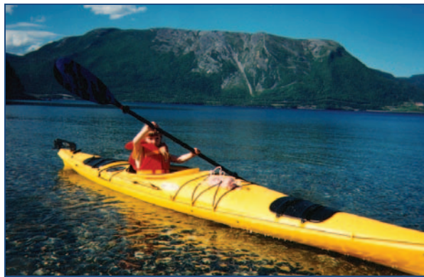
Sea kayaking in Gros Morne

"We have one of the top ten wreck sites in the world."