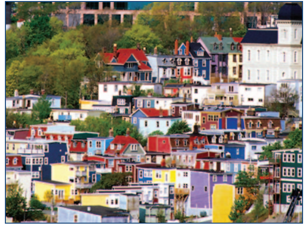
Jelly bean houses, St. John's