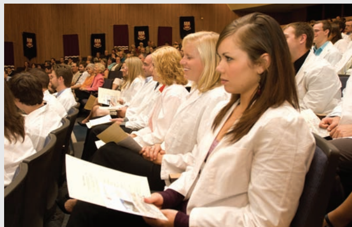
Students recited the Oath of Geneva at the end of the White Coat Ceremony.