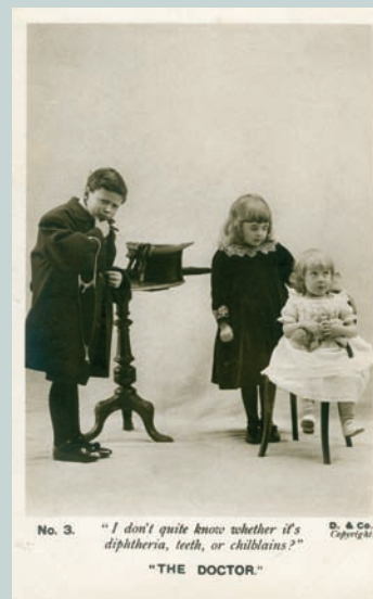
Postcard c. 1910: Offering an opinion!