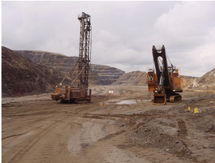
IOCC Mining Operations in Labrador