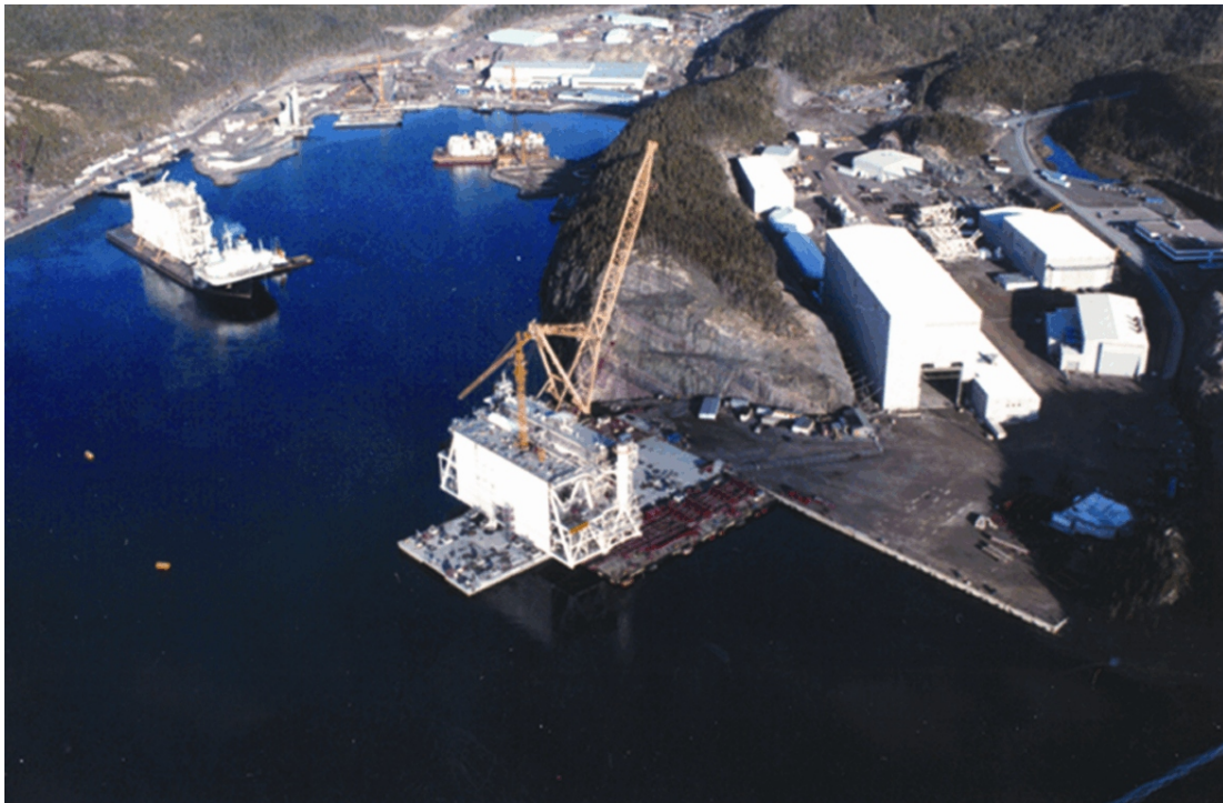
Bull Arm Fabrication Facility

Through cooperative efforts, government and industry are facing challenges and moving the resource industries forward. The Department recognizes the significant role that these and other stakeholders provided in reaching goals and milestones achieved in 2003-04 and would like to express appreciation for their support.