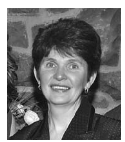
Rosalvn Blackwood Housing Food and Conference Services, Student Affairs and Services