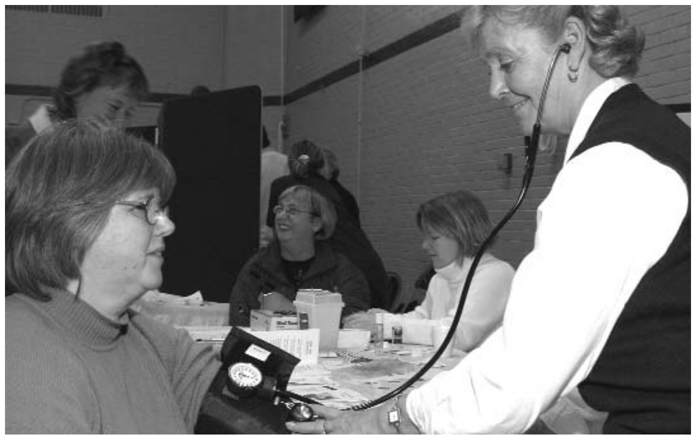
Calm under pressure: VON nurse taking the blood pressure of a MUN employee at the recent health fair.