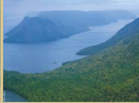
Little Grand Lake