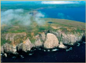
Cape St. Mary's