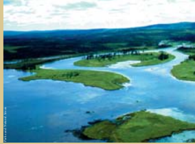
King George IV