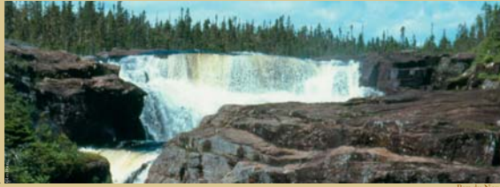
Bay du Nord