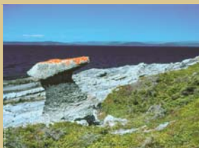
Hare Bay Islands