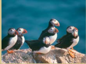
Witless Bay Islands