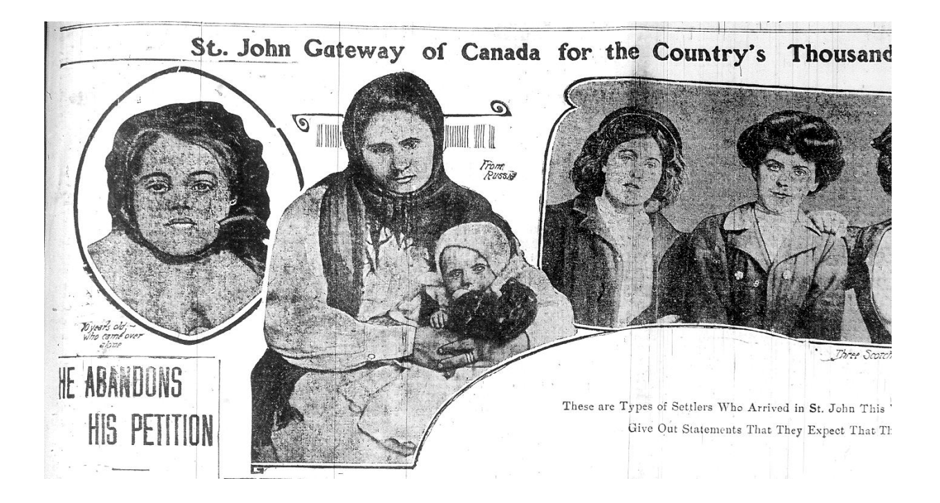
Image 2: Saint John Helps Build the Nation, Daily Sun, April 3, 1909