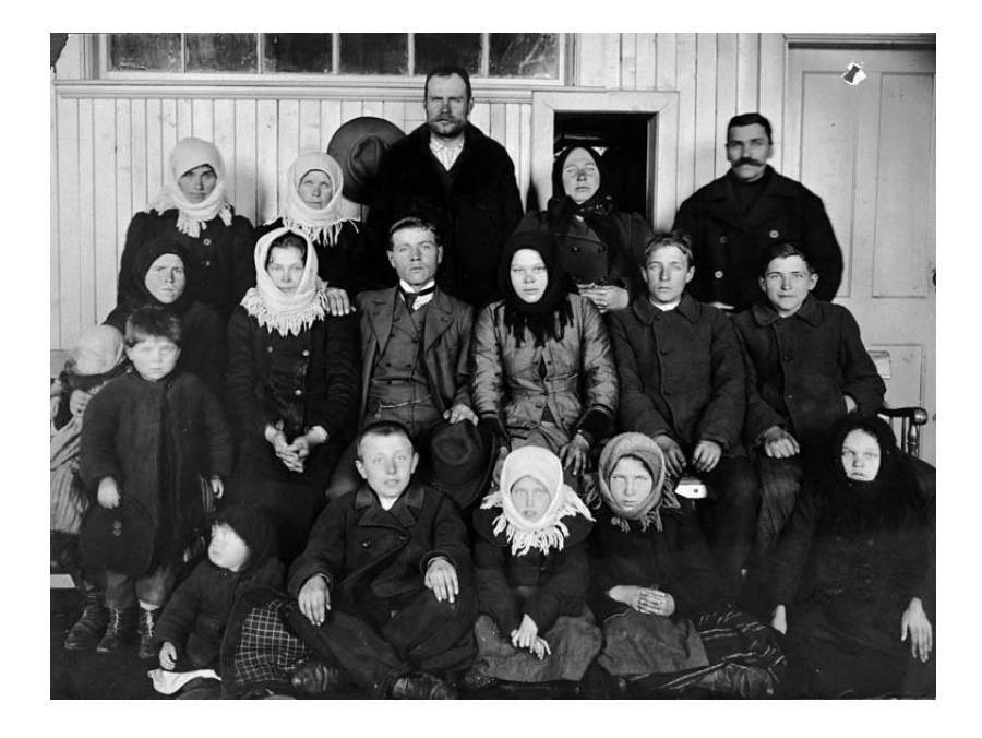
Image 1: Immigrants Arriving at Saint John, 1905