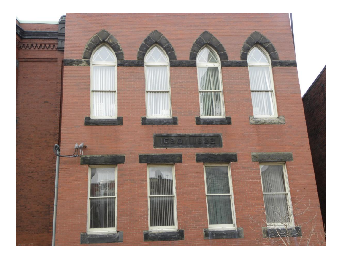
Image 7: former Loyal Orange Association Lodge, German Street, Saint John, 2009

the York Point-Mill Pond area of King's ward, a crowded waterfront area now the site of the Market Square development, urban roadways and office buildings. Inhabiting poorly built, crowded rented tenements, this working class population was subjected to poor sanitary conditions, which local authorities had pointed out as early as 1834. During the 1854 cholera epidemic, which claimed more than 2,500 lives, York Point suffered heavily.<sup>101</sup> Records dating from 1855 and 1856 indicate that the Board of Health prosecuted Irish immigrants and other members of the working class for keeping pigs in the tenements of Portland, York Point and other neighbourhoods.<sup>102</sup> Some neighbourhoods were identified with specific immigrant cultures. Peter Murphy's 1990 genealogical study of the Lower Cove area of Saint John's South end raises the issue of chain migration and urban ethnic enclaves. Together in Exile discusses how families from Carlingford parish, County Louth (north of Dublin), established a residential base in Saint John's Sydney ward. Many arrived in the years after 1844. For a generation or more, the "Coolies" (named after a point of coastal land in Carlingford parish) were active in the harbour and coastal fishery and dominated the fish business in the third quarter of the