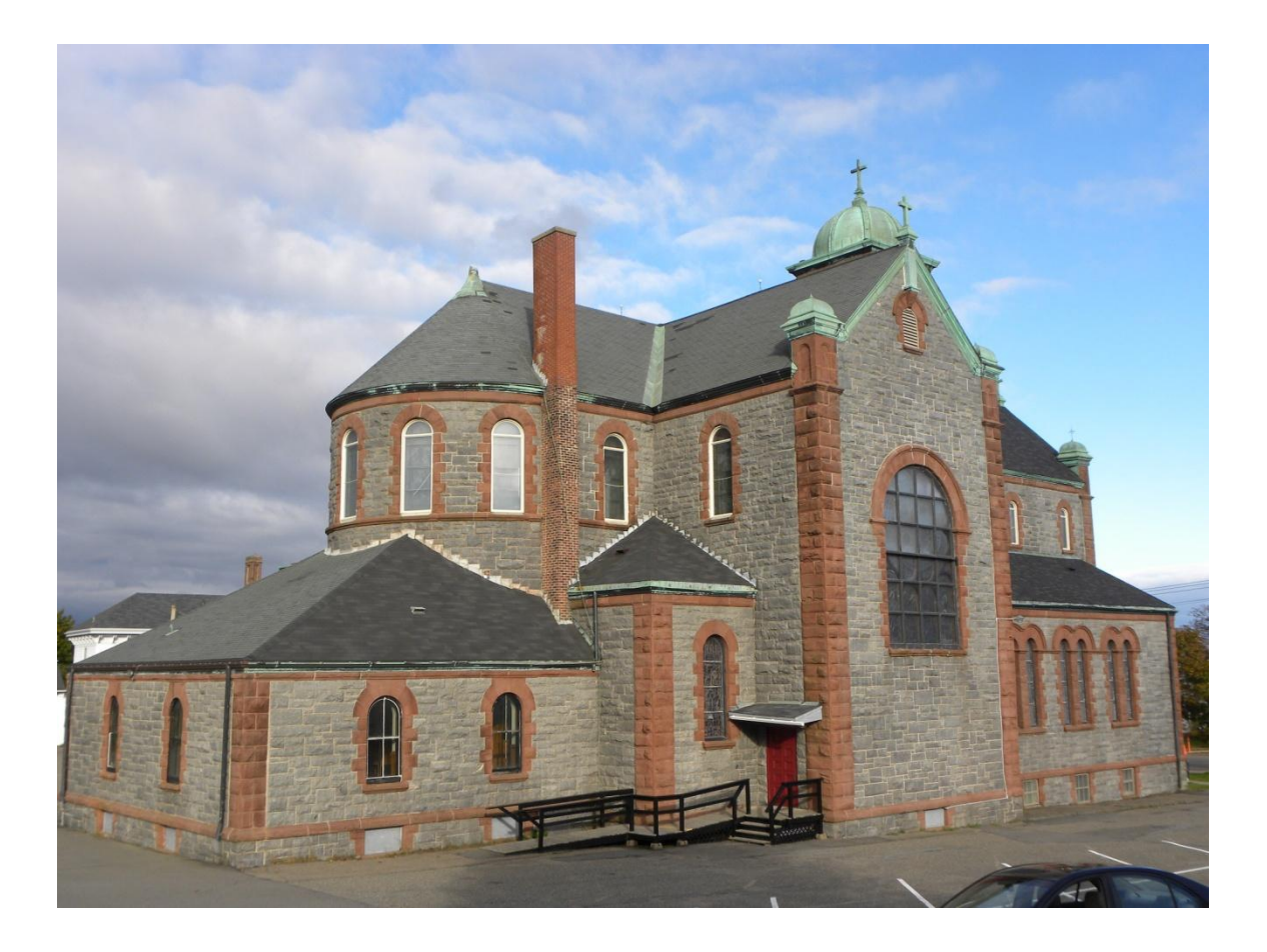
Image 4: Our Lady of Assumption Church, West Saint John

The most visible impact of immigration was the growth of the Catholic population and its associated institutions. By 1901, Catholics comprised 30% of the county's population. The original Catholic church near King Square, St. Malachi's, had been replaced by the Cathedral of the Immaculate Conception. Construction began on the new centre of the city's Catholicism, located in Wellington ward, before Confederation. In the 1850s, York Point in King's ward and the nearby waterfront district of Portland were the centres of Irish Catholic life. By the late 1800s, however, the expanding Irish Catholic community was also clustered in Lower Cove and Wellington and Prince wards. In Portland, on the northern border of Saint John, Catholics were served by St. Peter's church, near Fort Howe, starting in 1840.<sup>55</sup> As with Protestant churches, temperance made inroads by the 1840s. Most parishes had a total abstinence society, and by the 1870s, the city and province had an active