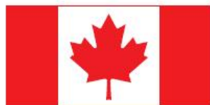
National Flag of Canada