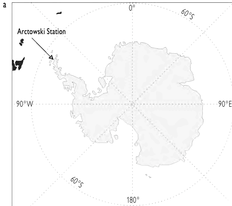
Figure 1 (a) Location of Polish Antarctic Station Arctowski, (b) ASPA-128 and ASPA-151 on King George Island and Arctowski (1).