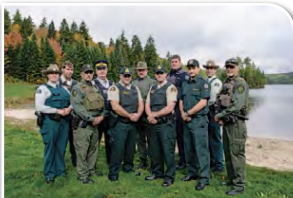
Photo: Inner Bay of Fundy Atlantic Salmon Law Enforcement Collaboration