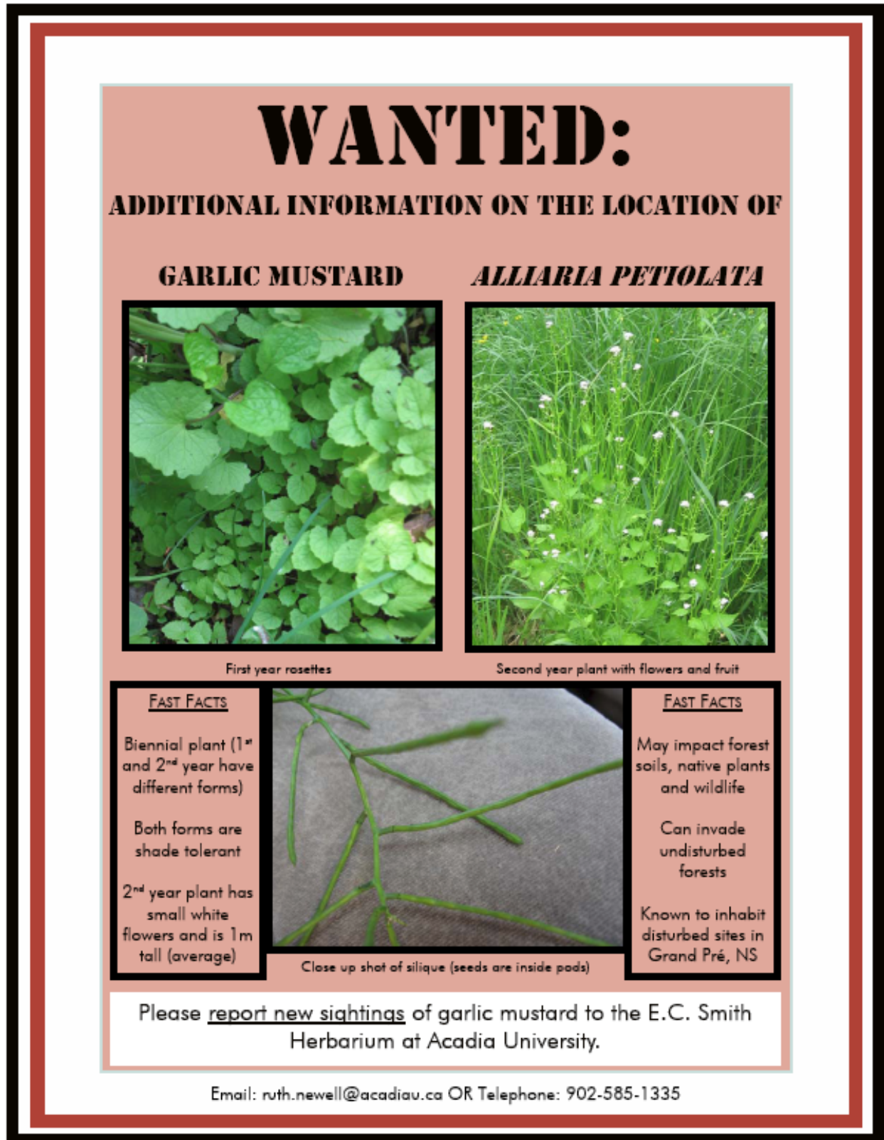
Figure 5. Poster to increase public awareness and solicit new reports of garlic mustard plants.