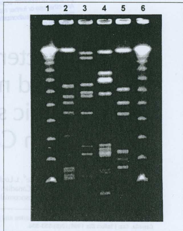
Figure 1) Representative DNA profiles obtained by pulsed field gel electrophoresis of Sma I digests from Canadian epidemic strains of methicillin-resistant Staphylococcus aureus (MRSA). Lanes 1 and 6, lambda DNA concatamers; lane 2, Canadian MRSA strain (CMRSA)-1; lane 3, CMRSA-2; lane 4, CMRSA-3; lane 5, CMRSA-4

Each of these epidemic strains have been associated with significant infections, including bacteremia and pneumonia. In surveillance conducted by CNISP, approximately half of all