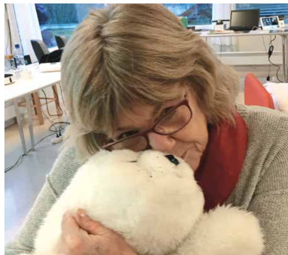
FIGURE 2: PARO interactive therapeutic robot in close contact with resident