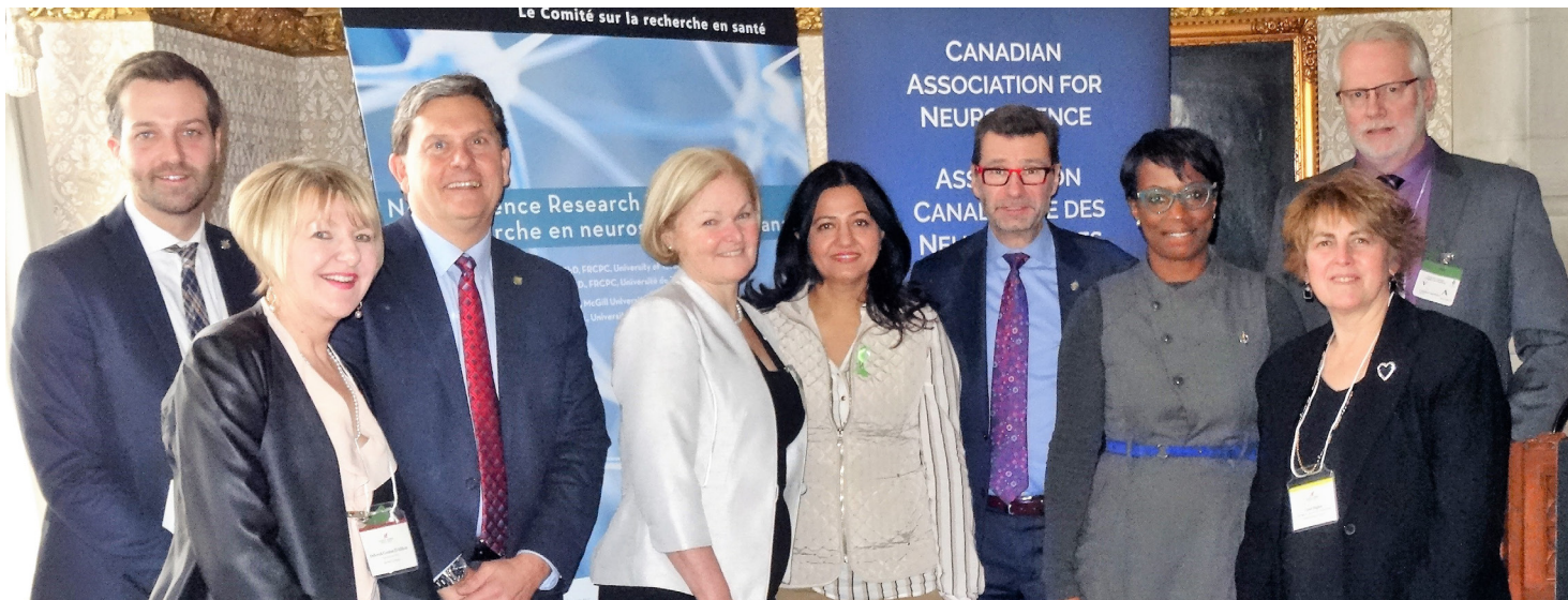
Health Research Caucus event Neuroscience Research in Canada , February 13, 2017.

Innovative Medicines Canada is the national voice of Canada's innovative pharmaceutical industry. We advocate for policies that enable the discovery, development and commercialization of innovative medicines and vaccines that improve the lives of all Canadians. We support our members' commitment to being valued partners in the Canadian healthcare system.