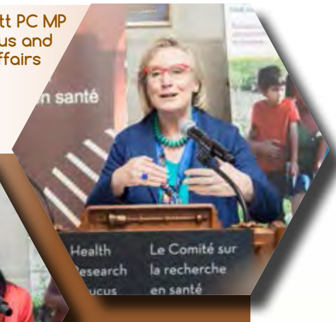
The Hon. Dr. Carolyn Bennett PC MP Minister of Indigenous and Northern Affairs

A reception on Indigenous Health Research in Canada on June 5, 2017, brought together Indigenous and non-Indigenous health researchers. The event was presided over by Minister Carolyn Bennett and attended by Minister Jane Philpott and close to 100 Members of Parliament.