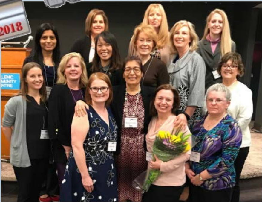
Organizing Committee of 2018 IPAC SWO Education Day