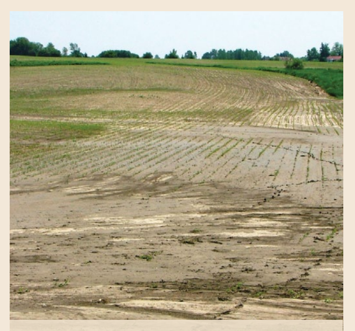
Widely spaced row crops leave bare soil conditions between rows for most of the growing season, making them prone to erosion and runoff during storm events.