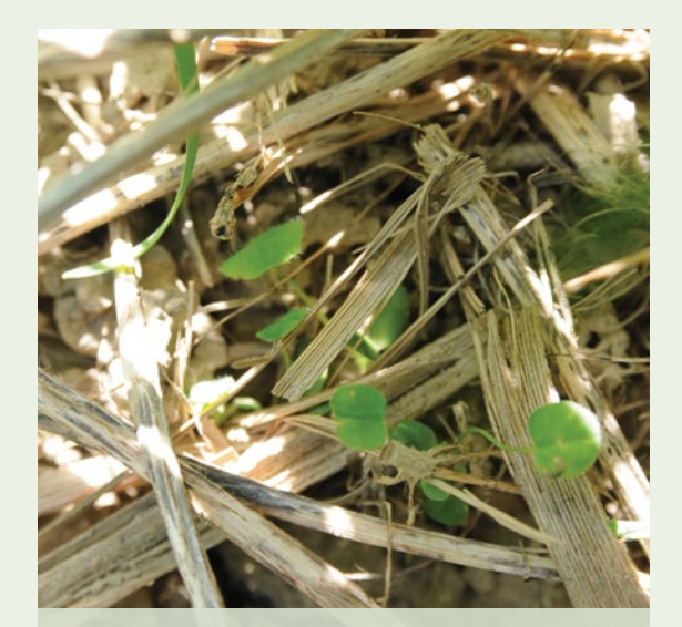
Red clover frost-seeded into winter wheat is one of the most traditional forms of interseeding using an over-seeding method. Note the unifoliate seedling clover among the residue from previous crops.

Inter-seeding is the planting of one or more cover crop species into an existing or established crop. Inter-seeded cover crops need to be a lot of things: shade-tolerant, drought-tolerant, fast-growing and able to suppress weeds without being competitive with the main crop and without posing a risk for pest infestation.