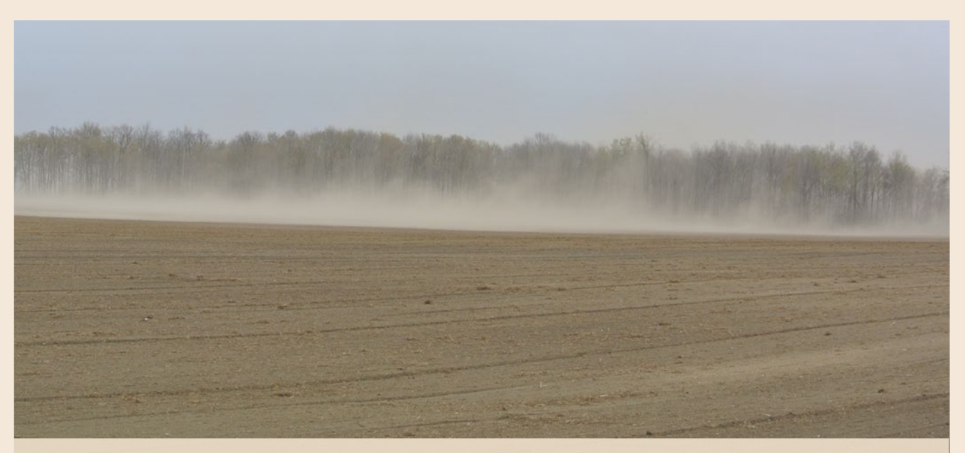
Bare, light-textured soils can be at risk of wind erosion after soils have been tilled and before crop canopies have developed sufficiently to provide cover, particularly in a dry year.