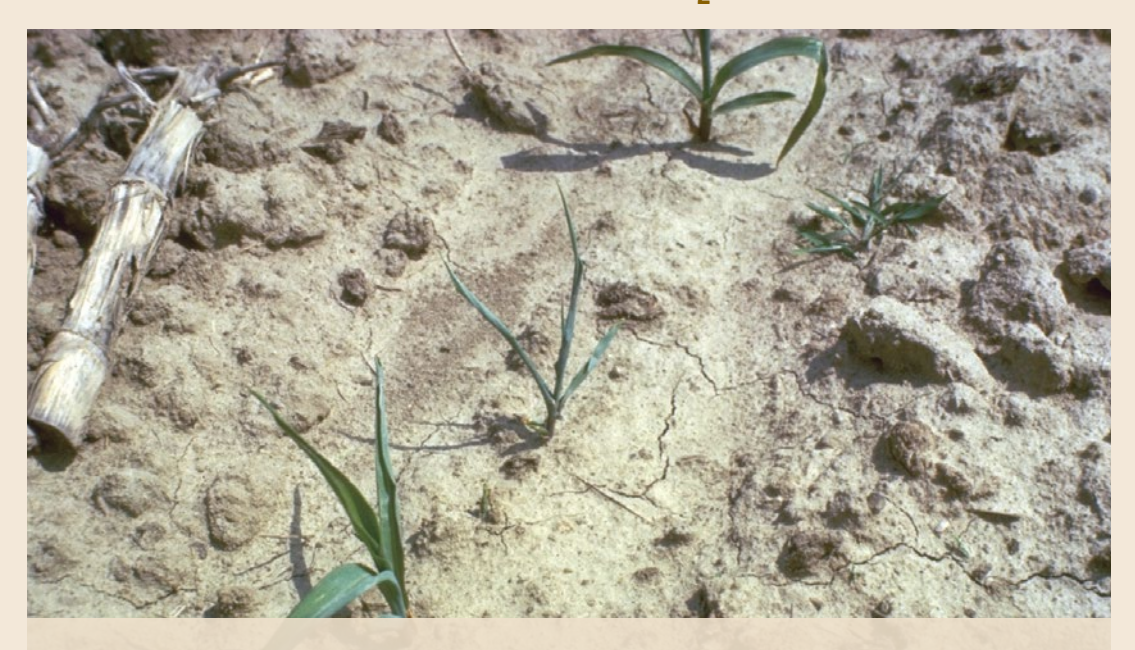
Frequent cultivation to control weeds or temporarily create soil structure will accelerate the depletion of soil organic matter and increase carbon emissions from cropland soils.