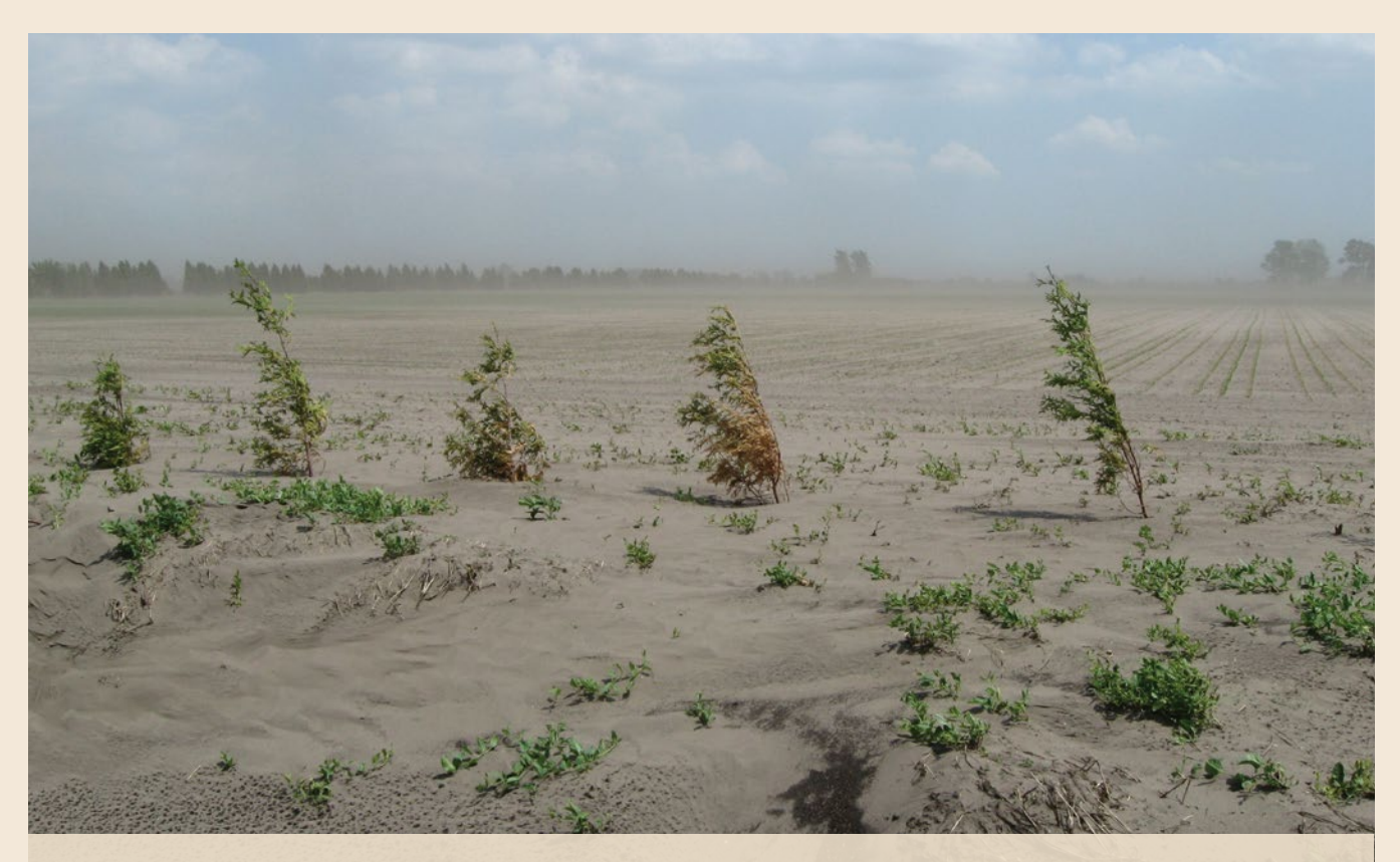
Large areas of clean-tilled soils in wide row crops are at risk of wind erosion and sand-blasting in late spring.