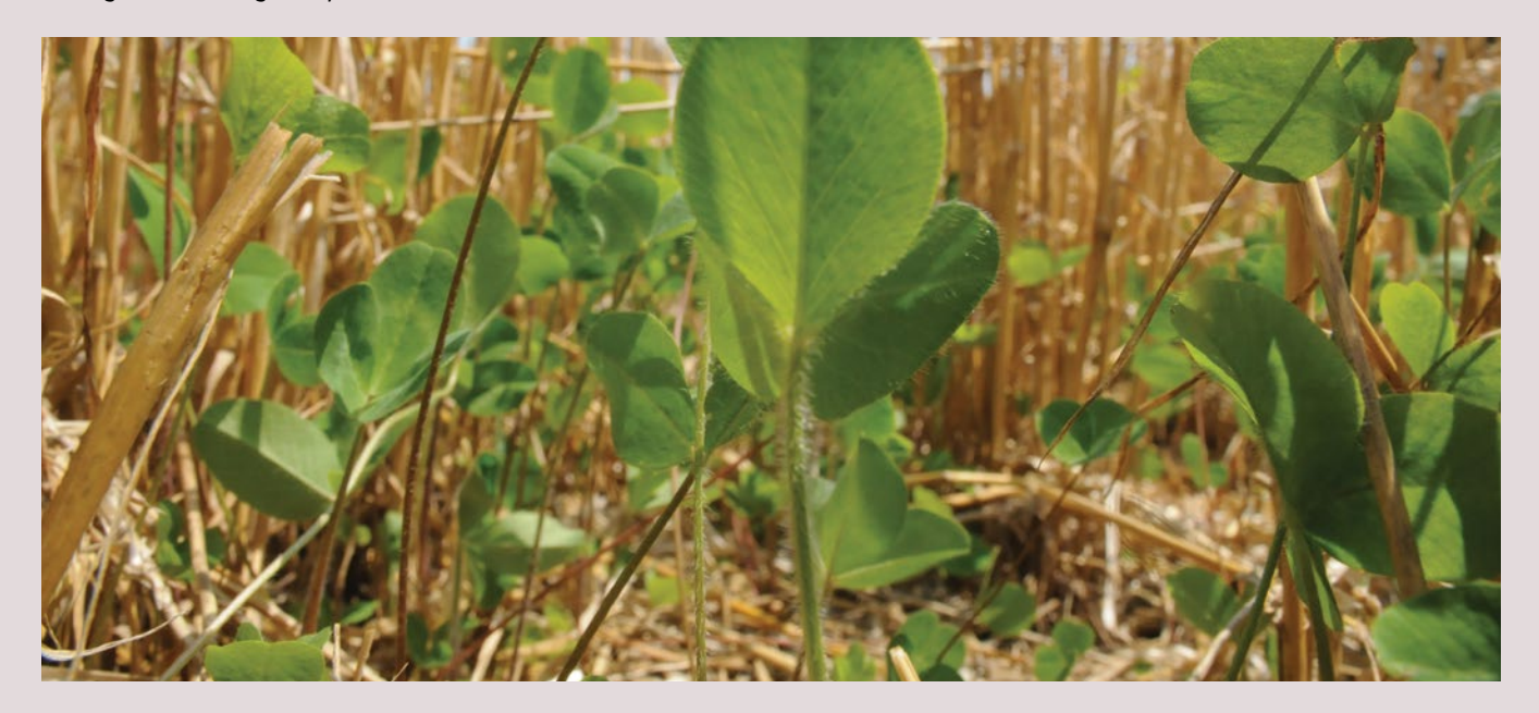
Red clover can be harvested as haylage or grazed directly.

Red clover can be killed chemically, plowed down in the spring or zone-tilled prior to planting corn. Red clover can be managed as a forage crop as well.