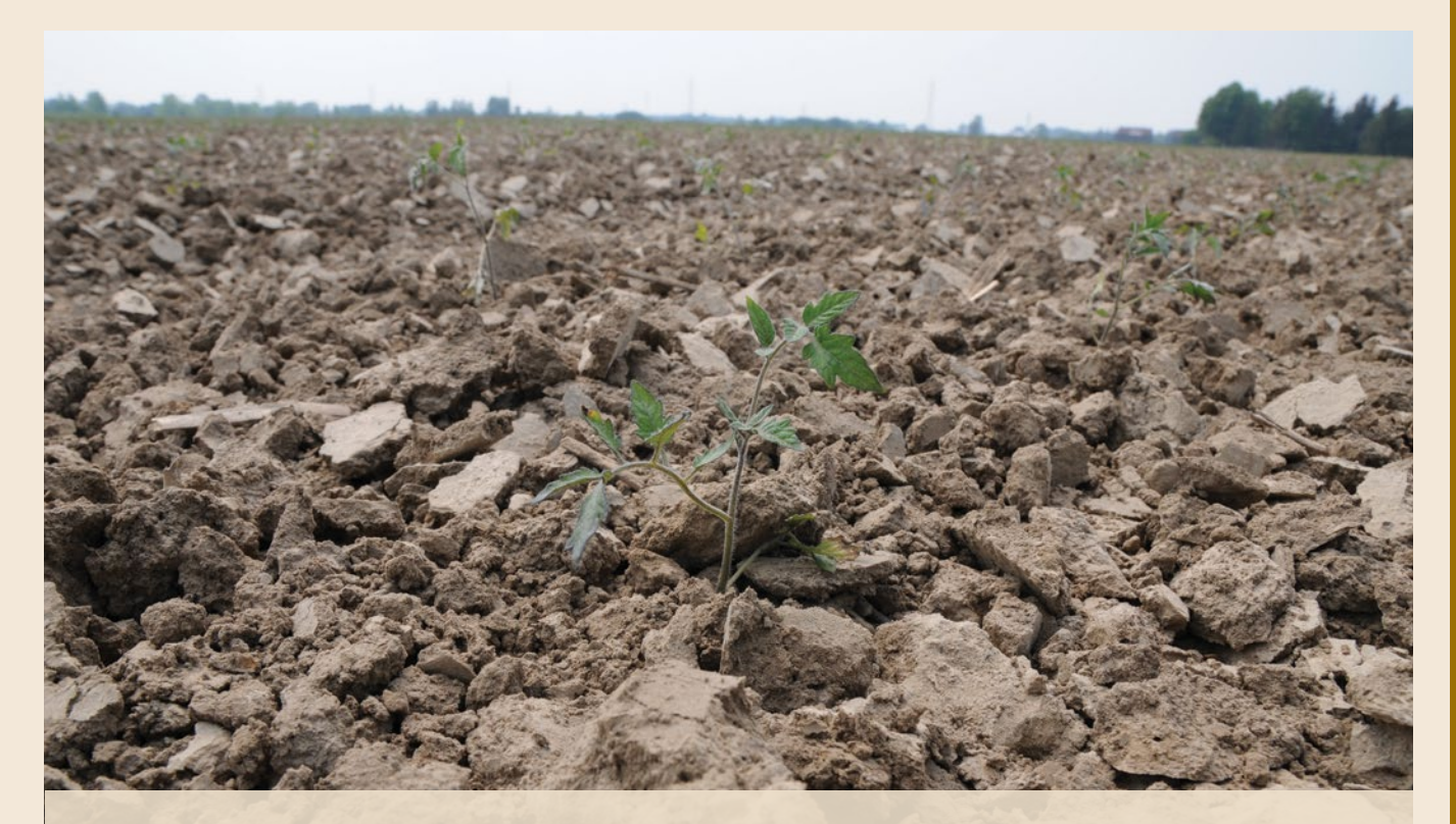
Bare, finely worked seedbeds are prone to ponding, puddling and crusting. Extra cultivation is often required to fix the problem, which further degrades the seedbed structure.