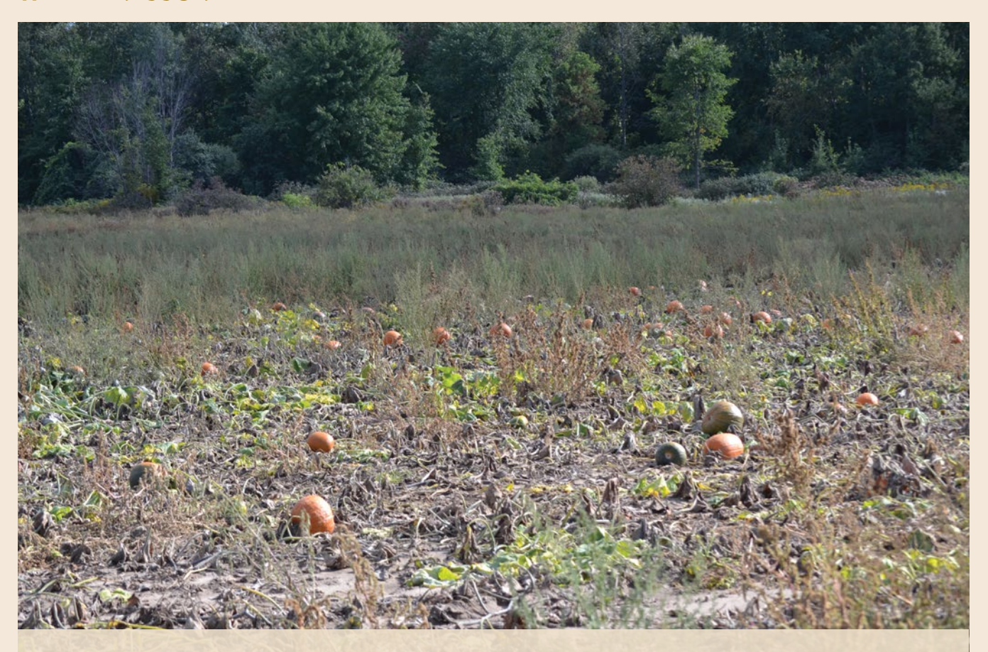
Widely spaced row crops are prone to weed infestation.