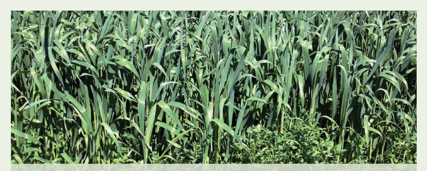
Fast-growing spring cereals such as oats and barley can be used as nurse crops that cover the soil while protecting forages (e.g., alfalfa) as they become established.

Nurse crops are annual crops used to assist in the establishment of perennial crops. Some forage legumes and grasses emerge and grow slowly – making an ideal condition for competing weeds. Growers often use fast-growing, competitive spring cereal nurse crops like oats, barley or wheat to dominate the site and allow the shade-tolerant forage crop to develop under its protection. The cereal can then be clipped or harvested as hay/haylage or allowed to mature to grain – freeing the forages to form a full canopy until first cut in the fall.