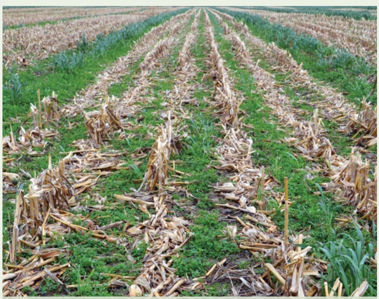
Some crop canopies open up as the crop matures, like this seed corn crop, allowing an inter-seeded cover crop to establish earlier than if planted after harvest.

Nurse crops are annual crops used to assist in the establishment of perennial crops. Some forage legumes and grasses emerge and grow slowly – making an ideal condition for competing weeds. Growers often use fast-growing, competitive spring cereal nurse crops like oats, barley or wheat to dominate the site and allow the shade-tolerant forage crop to develop under its protection. The cereal can then be clipped or harvested as hay/haylage or allowed to mature to grain – freeing the forages to form a full canopy until first cut in the fall.