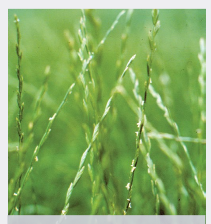
Annual ryegrass is an excellent choice as an interseeded cover crop for field corn due to its herbicide tolerance. However, this is a double-edged sword when it comes time to terminate the cover crop.

Terminating the cover crop will depend on the cover crop species (e.g., annual versus perennial) and the crop that follows it.