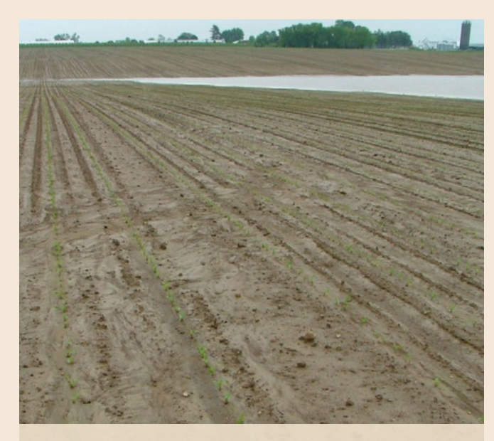
It's estimated that 80% of soil lost from cropland is the result of the impact of intense rainstorms, like the ones we get in late spring and early summer before the crop canopy closes and when tilled soils are loose.