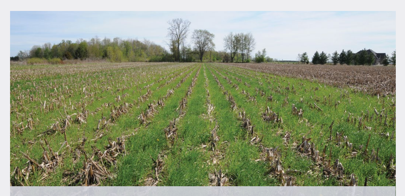
Spring crops grown as cover crops (oats, barley) grow well and provide good cover, then die over winter. They do not require chemical control, but need to be monitored for heading and harvest interference.