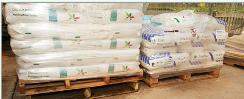
Maintain an inventory of fertilizer products stored on site.

Minimize the amount of fertilizer stored on your property.