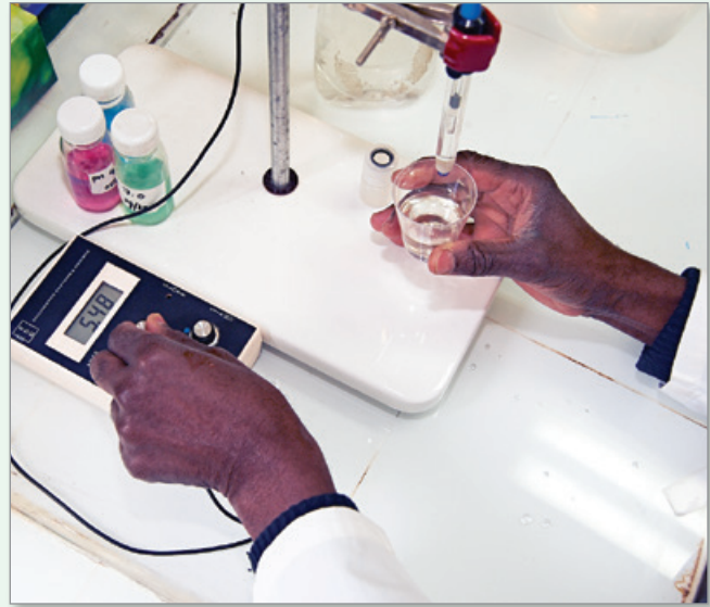
Knowing your water quality can identify potential risks, and allow you to manage them.