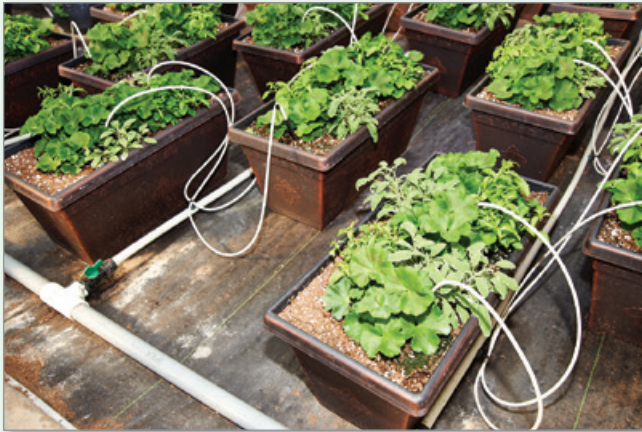
Pressure compensated low volume drip systems use less water and eliminate water loss between pots.