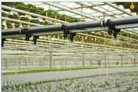
Overhead applied irrigation water is collected in a closed irrigation system.

Stay informed on the latest fertilizer research. Emerging formulations may offer benefits such as timed nutrient release which can be helpful for reducing nutrient levels in leachate overall.