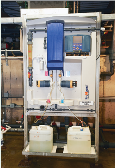
Flexible fertigation systems can match nutrients to crop specific needs, allowing for more efficient use of fertilizers.