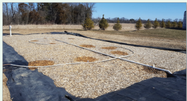
A vegetative filter strip (left) and a woodchip bioreactor (right) are water treatment options.