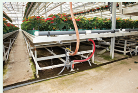
Collect and reuse leachate from overhead applied nutrient rich water applications if possible.