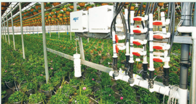
Irrigation systems should be designed to efficiently meet the requirements of crops at various stages of the production cycle.