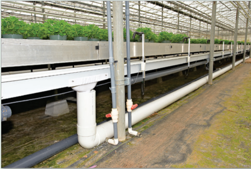
Closed systems may include technologies such as flood benches and troughs, which collect nutrient feedwater for reuse.

5. In Question 4, if you have ranked your greenhouse facility as 1 or 2, answer the following question. If you ranked your facility as 4, then proceed to Question 6.