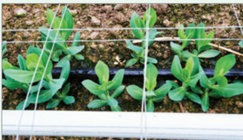
Know your soil type and regularly monitor EC and pH of growing beds.

If growing in ground, test and sterilize soils between production cycles. Monitor EC, and adjust pH and nutrients as required.