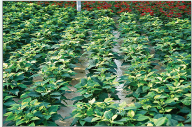
Sub-irrigation systems will only conserve water and nutrients in greenhouse production if water is collected, stored and reused.

B.8 If you use sub-irrigation, what percentage of your sub-irrigated production area is closed? A closed system is where irrigation water is collected, stored and reused for a future irrigation event.