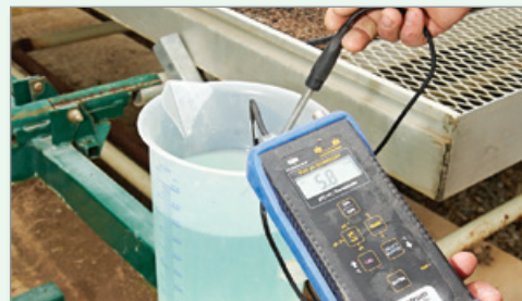
Regular testing of both irrigation water and media EC and pH can help to avoid nutrition and disease problems before they occur.