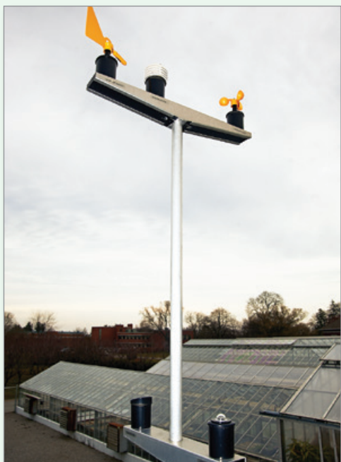
Greenhouse conditions, weather (such as light levels and temperature) and crop needs should be factored into your irrigation event schedule.

See also: BMP Water Management and BMP Irrigation Management