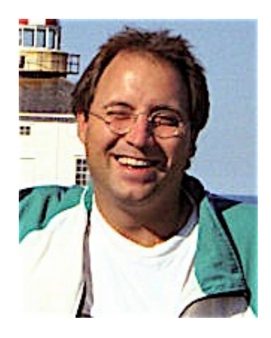
In dedication to and gratitude for the