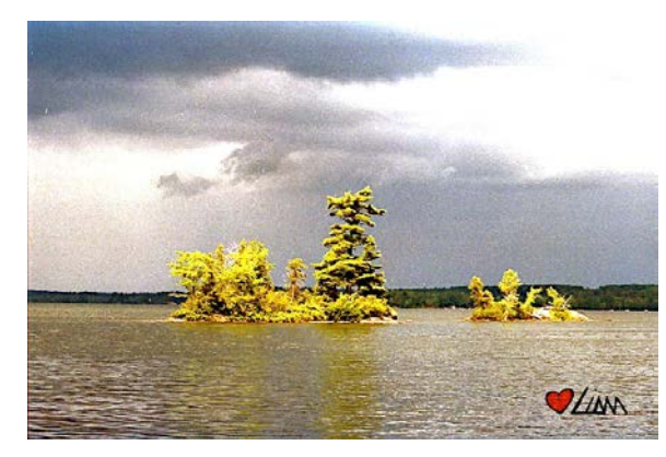
After The Storm, Head Lake, Ontario (1999) by Liam Broadmore

When the criminal courts are involved, it is not unusual for you to feel as if your grief and anxiety are magnified a thousand fold. If these waves of sadness make it excruciatingly difficult for you to cope, realize you are living out your worst nightmare. Take a deep breath and please reach out to your family and friends.