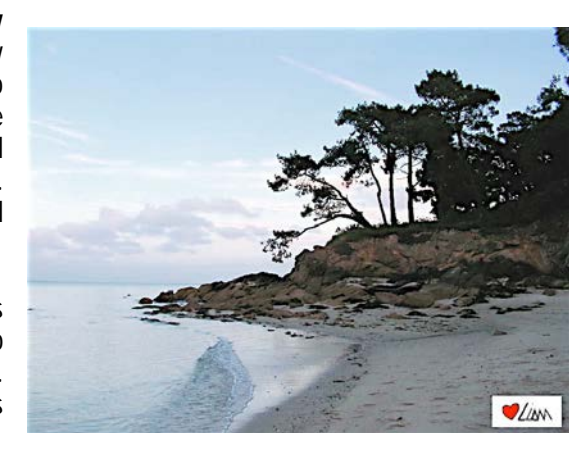
Low Tide, Fouesnant, Brittany (2000) by Liam Broadmore

Attempt to express your true emotions to those you trust. Unfortunately you as the bereaved will very often need to ask for what you require.