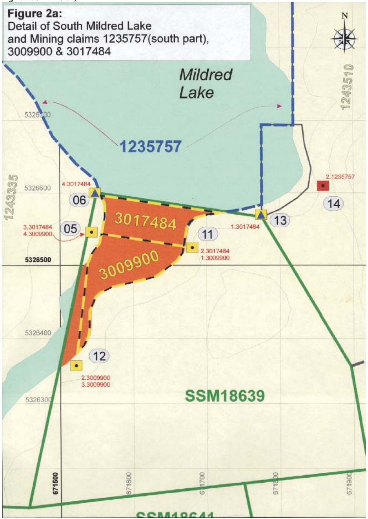
Figure 2a is an enlargement of the relevant portions of the map produced by Mr. Weirmeir following his ordered inspection of the three mining claims, conducted on November 8, 2006 (being Part 2, Figure 2a of Exhibit 4):