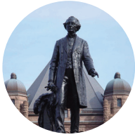
Sir John A. Macdonald

1. I am the first Prime Minister of Canada. I stand at the foot of Queen's Park and watch the cars pass by on University Avenue. Who am I?