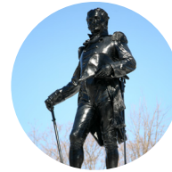
John Graves Simcoe

3. I am the official tree of Ontario. Three of us were planted here at Queen's Park by Her Majesty Queen Elizabeth II. Today, the flag of Ontario soars high above me. What kind of tree am I?