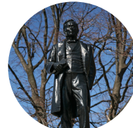
Sir Oliver Mowat

9. Around the corner from Queen Victoria, you will find a map of Canada. How many provinces can you spot on the map?