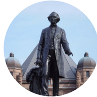
Sir John A. Macdonald