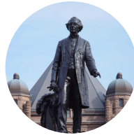
Sir John A. MacDonald