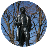
Sir Oliver Mowat

7. I was the third and longest-serving Premier of Ontario. I was Premier when the Ontario Legislative Building was opened. In 1897, I became the Queen's Provincial Representative, the Lieutenant Governor. If the cannons were in use today, I would be too close for comfort. Who am I?