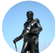
John Graves Simcoe