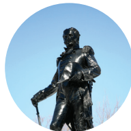
John Graves Simcoe