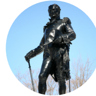
John Graves Simcoe

8. Although he is no relative of mine, the first Prime Minister of Canada and I have the same first and last name. I was Ontario's first Premier in 1867, although back then I was called the Prime Minister of Ontario. From where I stand, I can observe Queen Victoria without her knowing. Who am I?