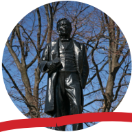
Sir Oliver Mowat

7. I was the third and longest-serving Premier of Ontario. I was Premier when the Ontario Legislative Building was opened. In 1897, I became the Queen's Provincial Representative, the Lieutenant Governor. If the cannons were in use today, I would be too close for comfort. Who am I?