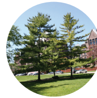
eastern white pine

4. I was Queen when Ontario's Parliament Building was constructed. The building and grounds are named "Queen's Park" after me. I have a clear view of the Eastern White Pine Trees. Who am I?