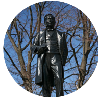
Sir Oliver Mowat