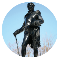
John Graves Simcoe