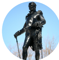
John Graves Simcoe