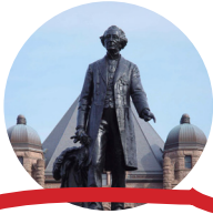
Sir John A. Macdonald

1. I am the first Prime Minister of Canada. I stand at the foot of Queen's Park and watch the cars pass by on University Avenue. Who am I?