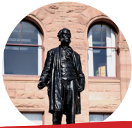
John Sandfield Macdonald

8. Although he is no relative of mine, the first Prime Minister of Canada and I have the same first and last name. I was Ontario's first Premier in 1867, although back then I was called the Prime Minister of Ontario. From where I stand, I can observe Queen Victoria without her knowing. Who am I?