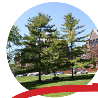
eastern white pine

4. I was Queen when Ontario's Parliament Building was constructed. The building and grounds are named "Queen's Park" after me. I have a clear view of the Eastern White Pine Trees. Who am I?