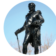
John Graves Simcoe

3. I am the official tree of Ontario. Three of us were planted here at Queen's Park by Her Majesty Queen Elizabeth II. Today, the flag of Ontario soars high above me. What kind of tree am I?