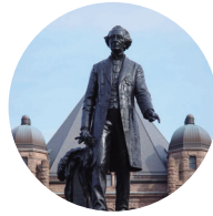
Sir John A. MacDonald