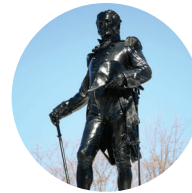
John Graves Simcoe

8. Although he is no relative of mine, the first Prime Minister of Canada and I have the same first and last name. I was Ontario's first Premier in 1867, although back then I was called the Prime Minister of Ontario. From where I stand, I can observe Queen Victoria without her knowing. Who am I?