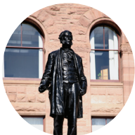
John Sandfield Macdonald

8. Although he is no relative of mine, the first Prime Minister of Canada and I have the same first and last name. I was Ontario's first Premier in 1867, although back then I was called the Prime Minister of Ontario. From where I stand, I can observe Queen Victoria without her knowing. Who am I?