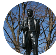
Sir Oliver Mowat

9. Around the corner from Queen Victoria, you will find a map of Canada. How many provinces can you spot on the map?