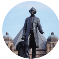
Sir John A. Macdonald