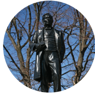
Sir Oliver Mowat