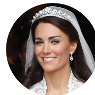
Catherine, Duchess of Cambridge