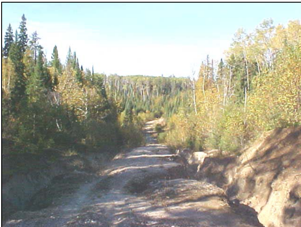
Figure 2: An old forest access road in the conservation reserve.

The implementation of the SCI will be the mandate of the MNR at the District level; however, associations with various partners may be sought to assist in the delivery. This SCI is a working document, and as a result, it may be necessary to make revisions to it from time to time.