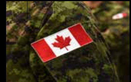
IN THE NEWS In-depth coverage of Canadian communities, veterans benefits and today's military news