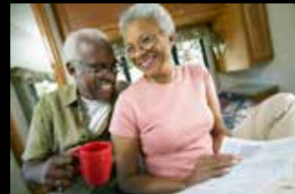
HUMOUR HUNT Amusing stories from our readers