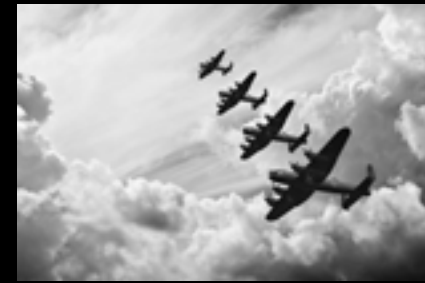
ON THIS DATE Highlights of historic events, day-by-day