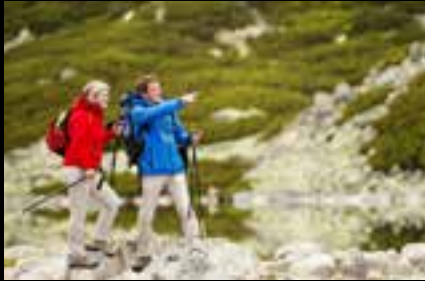
MILITARY HEALTH MATTERS Medical trends and research