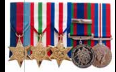
ARTIFACTS Fascinating relics from military history