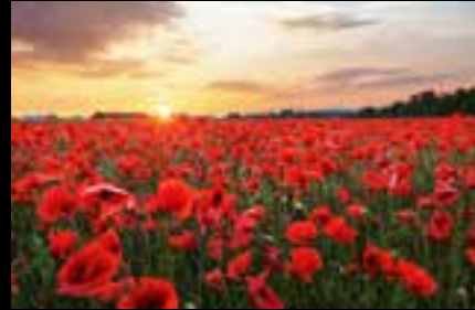
FACE TO FACE Debates over controversial questions from our history