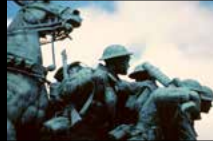
HEROES AND VILLAINS Celebrated and notorious adversaries