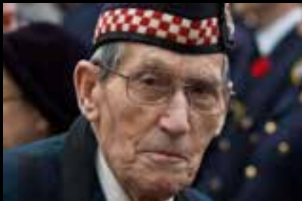
O CANADA Tales of deeds and people who shaped our country